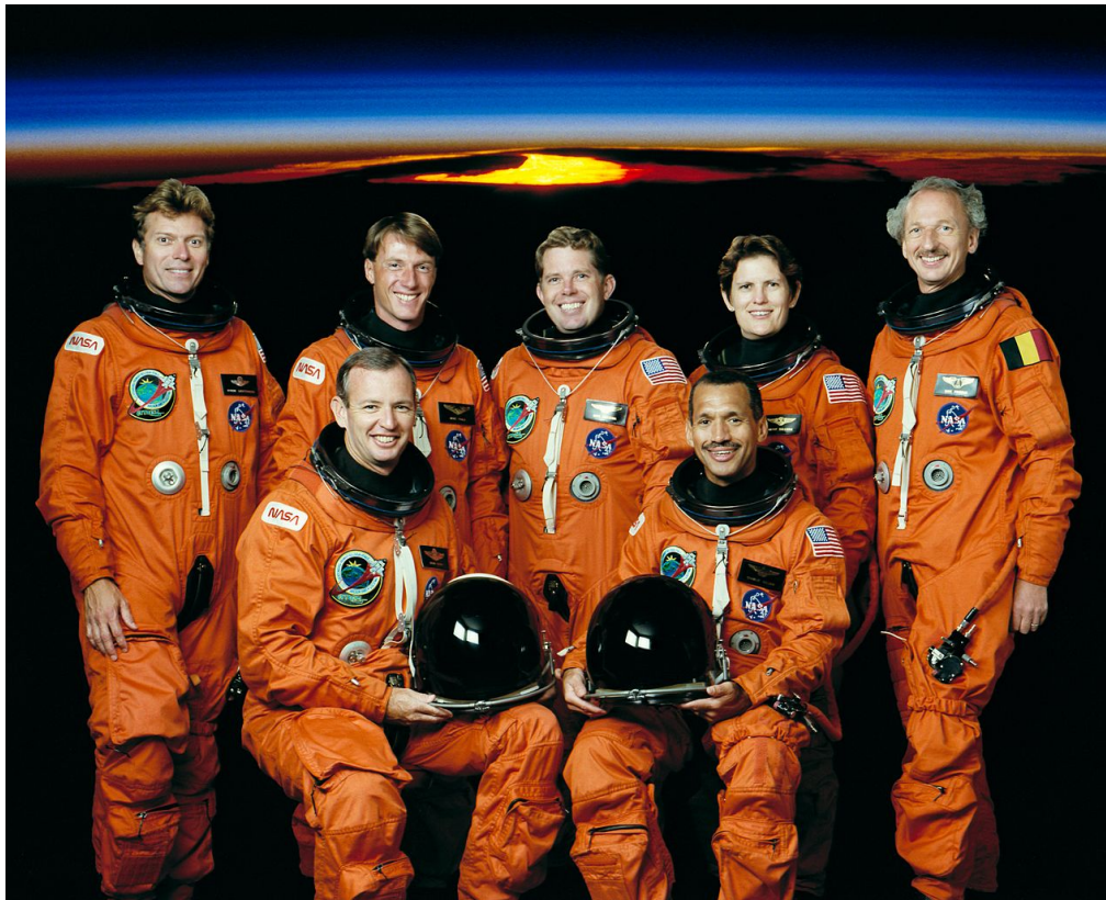
Figure 1: STS-45 crew photo with, from left to right, in front: pilot Brian Duffy and commander Charles F. Bolden Jr. backed by payload specialist Byron K. Lichtenberg, mission specialist C. Michael Foale, mission specialist David C. Leestma, payload commander Kathryn D. Sullivan and payload specialist Dirk D. Frimout.