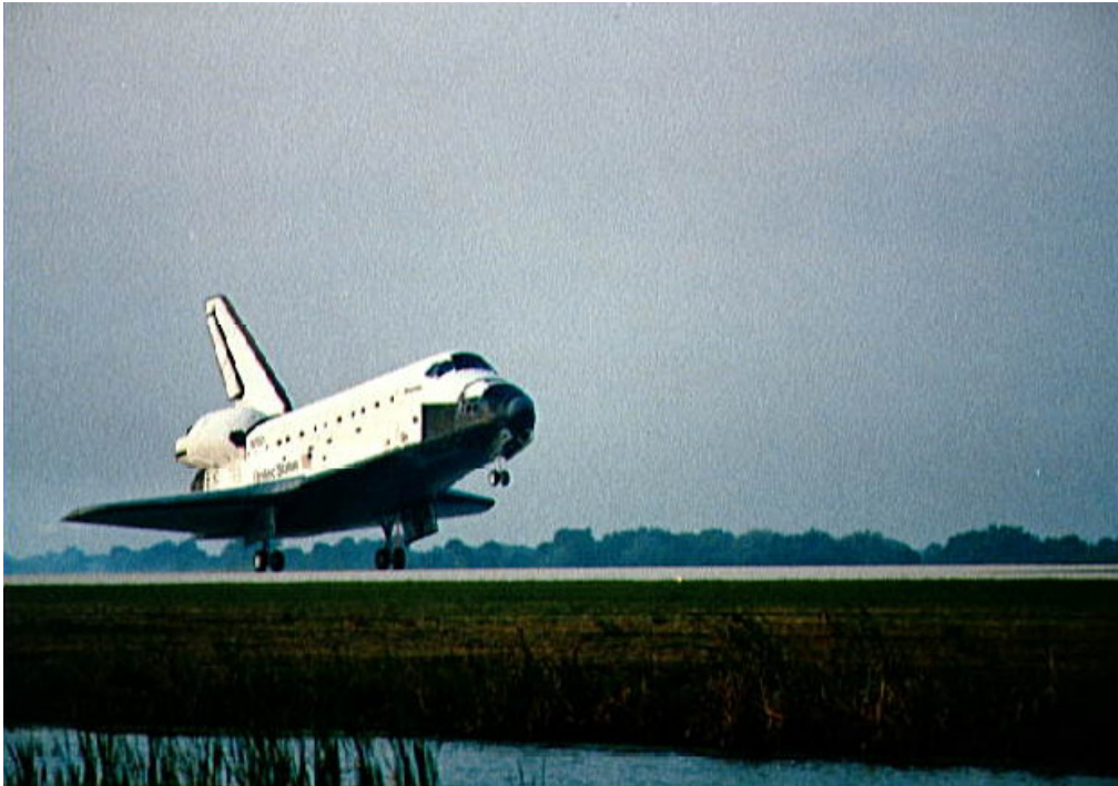
Figure 3: STS-45 landing at Kennedy Space Center, Florida.