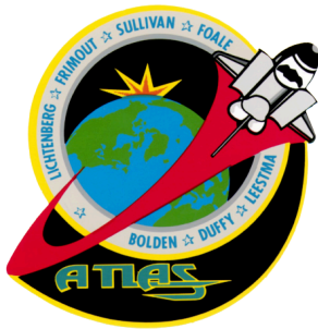
STS-45 crew patch

The mission carried the first Atmospheric Laboratory for Applications and Science (ATLAS-1) on Space-lab pallets mounted in the orbiter’s cargo bay. The non-deployable payload, equipped with 12 instruments from the U.S., France, Germany, Belgium, Switzerland, the Netherlands and Japan, conducted studies in atmospheric chemistry, solar radiation, space plasma physics and ultraviolet astronomy.