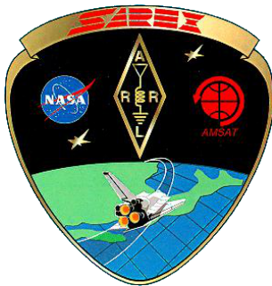
The SAREX patch

The Shuttle Amateur Radio Experiment (SAREX) was a long-running program to use amateur radio equipment on board NASA's Space Shuttle, the Russian Mir space station, and the International Space Station. It involved students in exchanging questions and answers with astronauts on orbit. More than 200 schools participated. It was also used to conduct communications experiments with amateur radio operators on the ground. Detailed information about