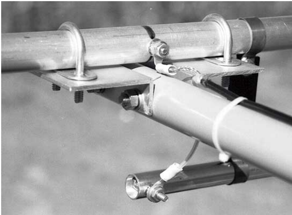
Figure 1: Detail of a gamma match: the shield of the coaxial feed line is connected to the center of a driver dipole. Source: Al Alvareztorres, AA1DO 5