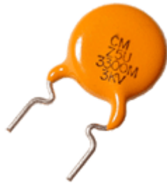
ceramic disc capacitor

Some ceramic disc capacitor are rated up to the kilovolt range. However, RF current handling is limited due to the narrow lead contacts and the skin effect. Some suppliers: