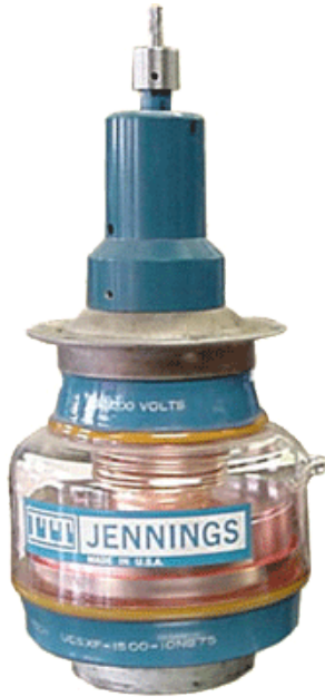
variable vacuum capacitor