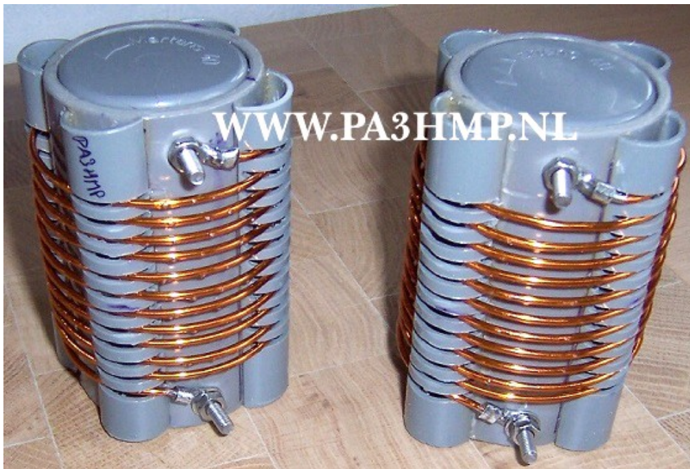
Figure 1: Trap coils by PA3HMP