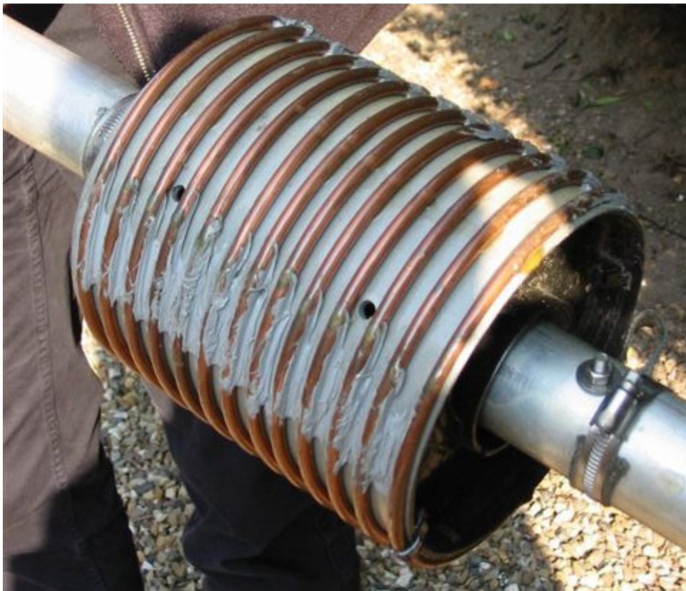
Figure 3: Brake pipe coil by ON4AEK