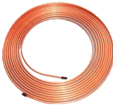
Figure 4: Copper brake pipe