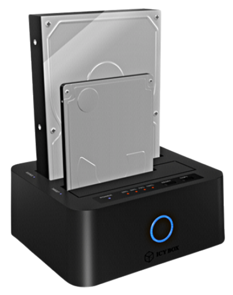
Figure 2: Icy Box IB-123CL-U3 USB 3 connected HD docking and cloning station