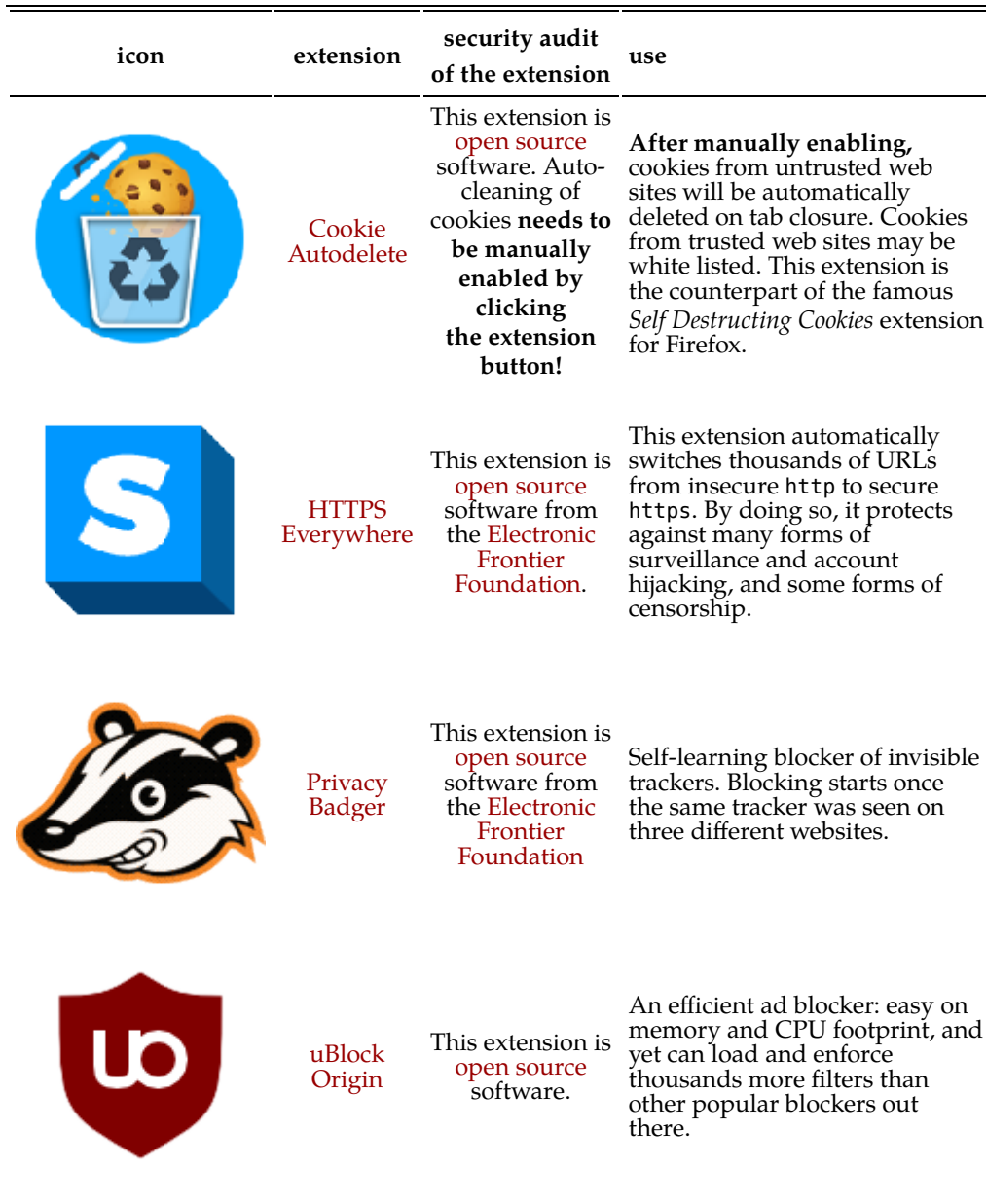
Table 1: Secure extensions for privacy