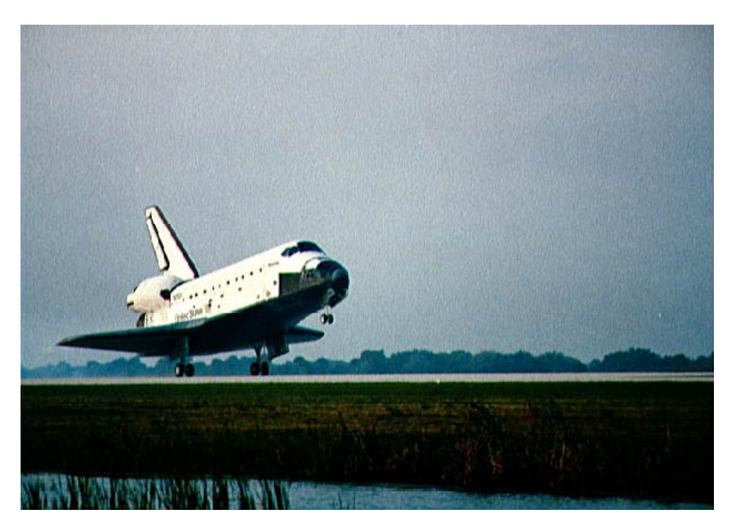
Figure 3: STS-45 landing at Kennedy Space Center, Florida.