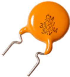
ceramic disc capacitor

Some ceramic disc capacitors are rated up to the kilovolt range. However, RF current handling is limited due to the narrow lead contacts and the skin effect. Some suppliers: