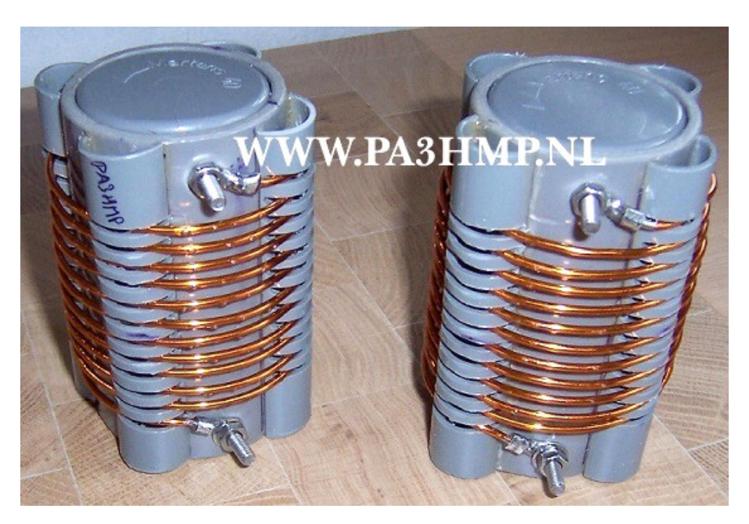
Figure 1: Trap coils by PA3HMP