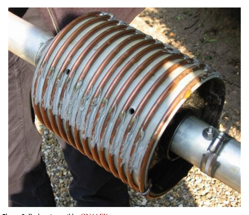
Figure 3: Brake pipe coil by ON4AEK