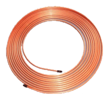
Figure 4: Copper brake pipe