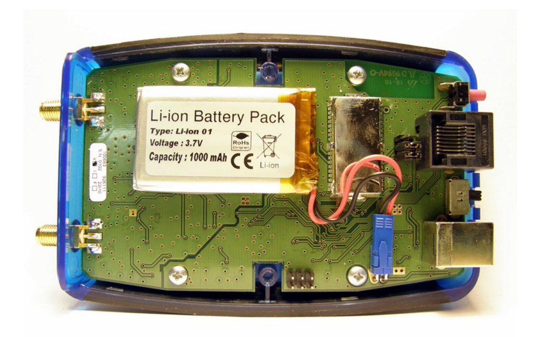
Figure 4: The lithium-ion battery pack inside the miniVNA PRO

Indeed, reinstalling the latest firmware using vna/J on GNU/Linux resolved my issue. This seems to indicate that the miniVNA PRO's firmware memory is volatile when the lithium-ion battery loses its charge.