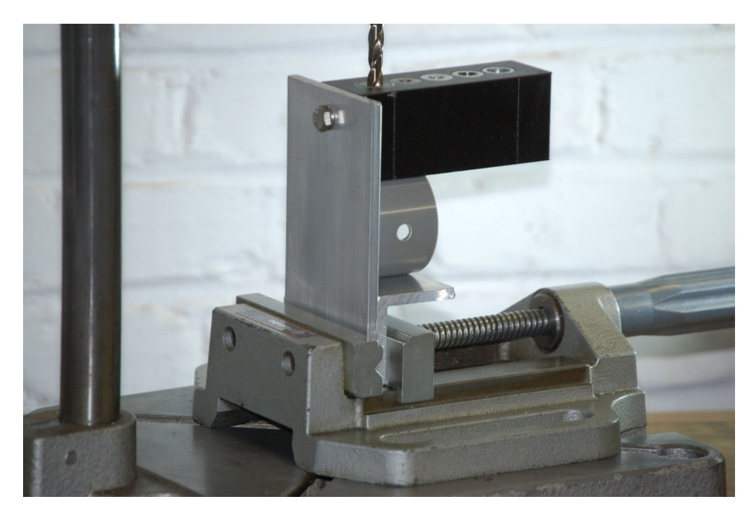
Figure 4: Drilling a PVC spreader for an open star quad line using a slightly modified V-block from Aliexpress. The V-block is screwed against an aluminium back panel. The pipe for the spreader is OD 50 mm thin-walled grey PVC. It fits snugly between the V-block and the pre-drilled aluminium angle stock. The PVC pipe is 36 mm long, putting the first hole of the V-block at its center. Four holes are drilled two at a time with a Ø7 mm HSS drill bit. Always drill vertically through a V-block and apply ample lubricant to prevent wear of the V-block drill cylinders.

Figure 3: Cutting 36 mm lengths of thin-walled OD 50 mm PVC pipe with a mitre saw. A clamped block of wood at 36 mm from the saw blade serves as an end stop. Use personal protective equipment (PPE) when operating power tools.