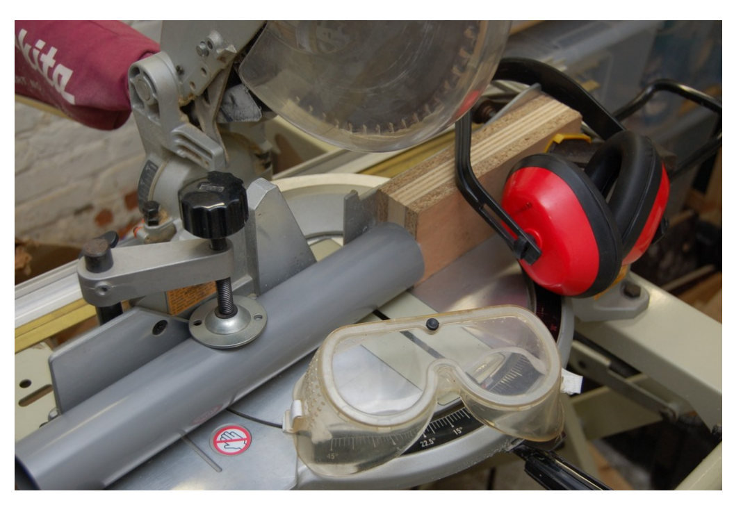
Figure 3: Cutting 36 mm lengths of thin-walled OD 50 mm PVC pipe with a mitre saw. A clamped block of wood at 36 mm from the saw blade serves as an end stop. Use personal protective equipment (PPE) when operating power tools.